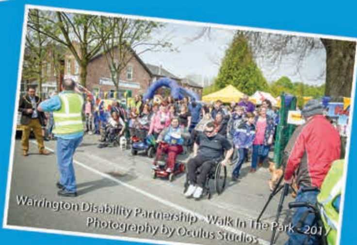
Warrington Disability Partnership - Walk In The Park - 2017