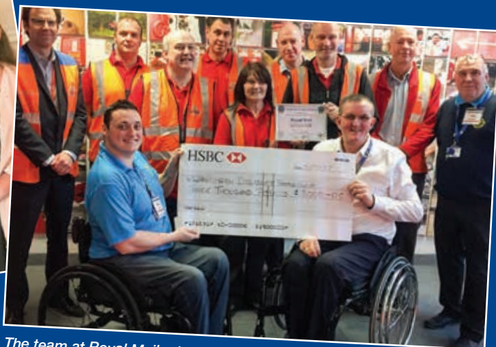
The team at Royal Mail raised over £3,000 through a variety of events.