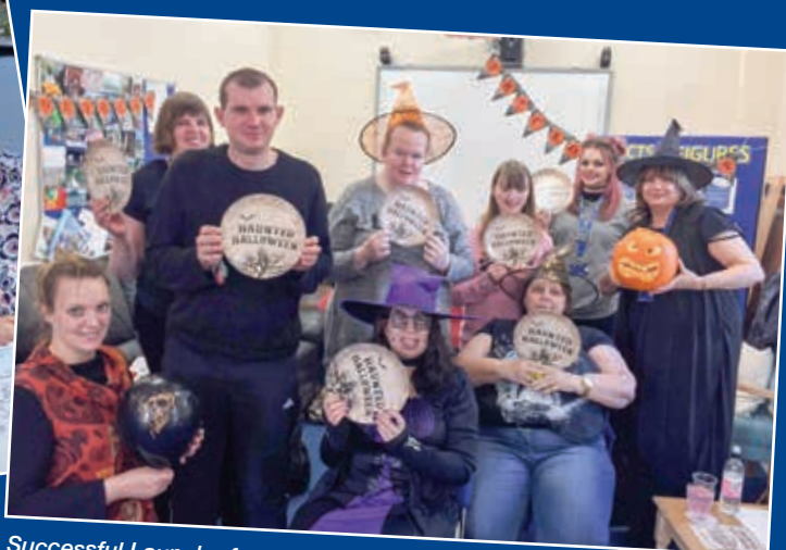
Successful Launch of our new 'Monday Club' for the under 55's. Thanks to the West Area Board for funding some of the activities.