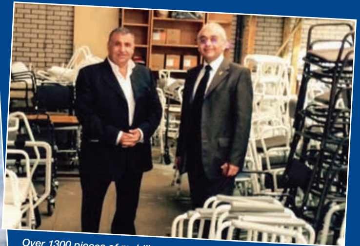
Over 1300 pieces of mobility equipment have been shipped to other countries in need (including Egypt, Thailand and Syria) during the first year of the Phoenix Project in partnership with St Mark Universal Copts Care charity.