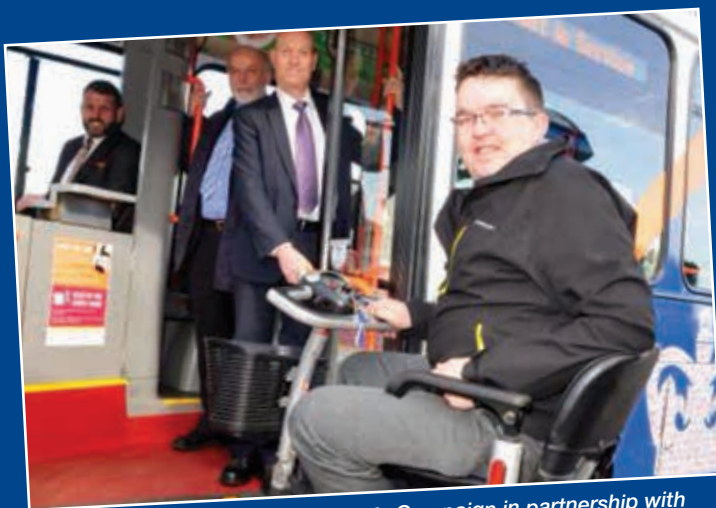
Successful launch of the Scoota Safe Campaign in partnership with Network Warrington, Warrington Borough Council and the Cheshire Police and Crime Commissioner.