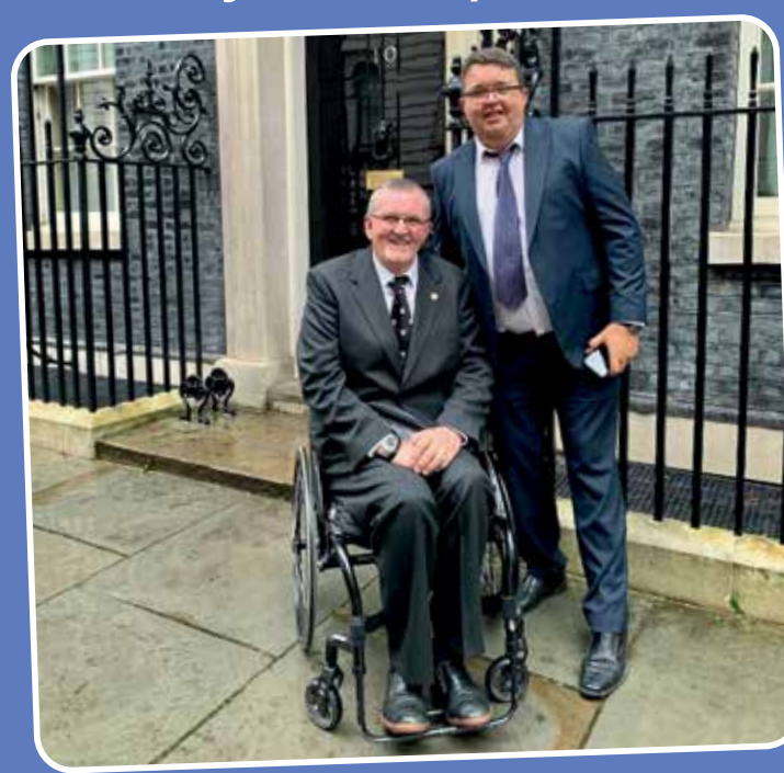
Members of Team WDP were invited to a special reception at 10 Downing Street to celebrate their achievements and to say thank you on behalf of everyone who they've helped in Warrington South.