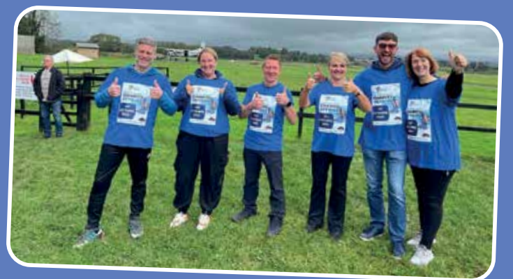
WDP Team members and supporters took part in a Skydive raising over £3000