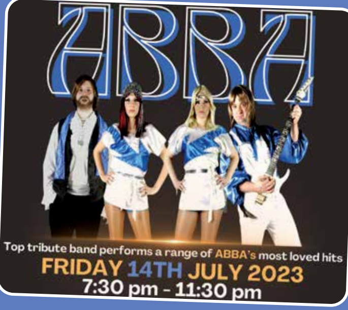
Successful 'SOLD OUT' 'Bjorn to be Abba' fundraising event as part of our DAD Week Activities, raising over £3,000.