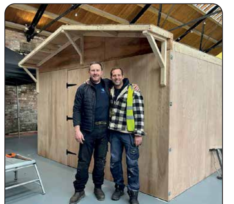
UPS Builders building Santa's Grotto